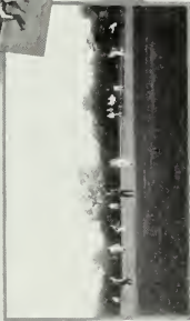
An Outdoor Gym Class